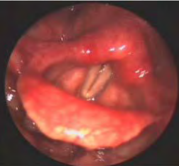
Fig. 1B Score 3