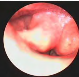
Fig. 1C Score 5

Figure 1: High-speed films scores with 4,000 pictures per second of the larynx including the arytenoid regions. Score 1 is a normal arytenoid region and normal vocal folds. Score 3 is presenting a moderate oedema of the arytenoid region and normal vocal folds. Score 5 is almost total closure of the larynx due to arytenoid oedema (3).