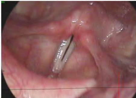
Fig. 1A Score 1